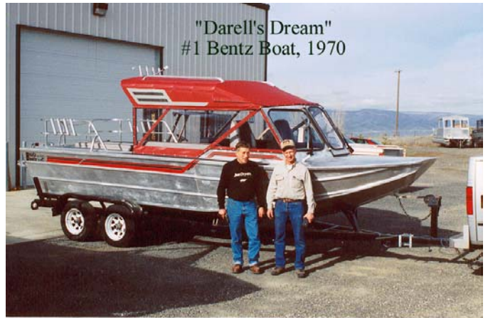
"Darell's Dream" #1 Bentz Boat, 1970